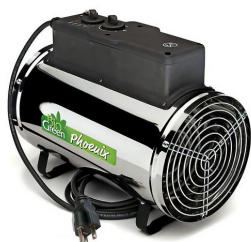
Bio Green Phoenix

Splash proof, 2,800W heating output. 270 CFM air circulation. Comes with built-in thermostat. Designed to be floor-standing or hanging. Fan setting perfect for increased circulation in summer months. Suitable for medium-sized greenhouses.