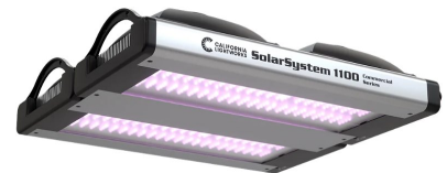
SolarSystem 1100 . . . $1,275

Lightweight and powerful, the SolarSystem 1100 is capable of replacing a 1000 watt HPS system. Can be used for veg or bloom. Fully programmable spectrum control. Covers a 5' x 5' bloom area or an 8' x 8' vegetative area.