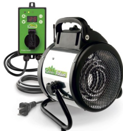
Bio Green Palma

Splash proof, includes digital thermostat, 2,000W heating output, 95 CFM air circulation. Economical to operate. Suitable for smaller greenhouses.