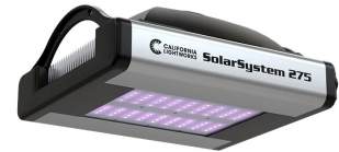
SolarSystem 275 . . . $390