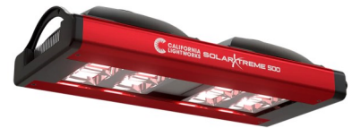
SolarXtreme 500 . . . $400

Features CA Lightwork's exclusive Optigrow® light spectrum which offers the best results for all phases of growth in a single fixture. Optigrow® has been specially formulated and tested to give the best results in while offering full power for bloom and high yields. Consumes from 200 to 800 watts. Covers a 4 x 4 foot area.