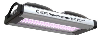
SolarSystem 550 . . . $650

The SolarSystem 550 LED grow light system offers programmable spectrum control over multiple wavelengths. It operates at a frequency of 50-60 Hz and draws a maximum current of 3.3A @ 120 V, 1.65 A @ 240 V. Power consumption ranges from 0-400 W. Covers bloom area of 4' x 4' and a vegetative coverage of 6' x 6'. Perfect as a single light or use several lights to cover a larger area underneath benches.